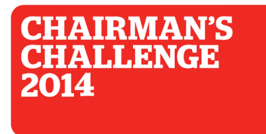
英國保誠「主席公益獎勵計劃」 Prudential plc Chairman's Challenge Award