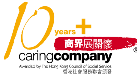
「商界展關懷」 The Caring Company

Prudential's CSR work has been acknowledged by a wide range of global and local awards.