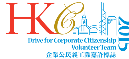
企業公民嘉許 Corporate Citizen Award